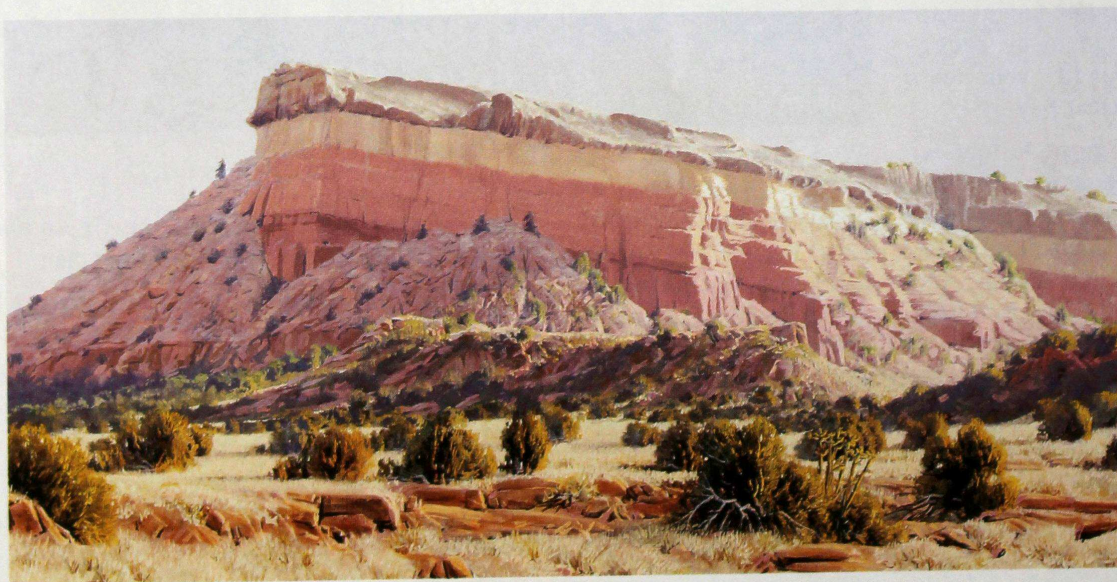
NEAPOLITAN CLIFFS WEST OF SAN YSIDRO, OIL, 36 x 60.

Galleries: Nedra Matteucci Galleries, Santa Fe, NM; Altermann Galleries, Dallas, TX; Morris & Whiteside Galleries, Hilton Head Island, SC; and Grapevine Gallery, Oklahoma City, OK.