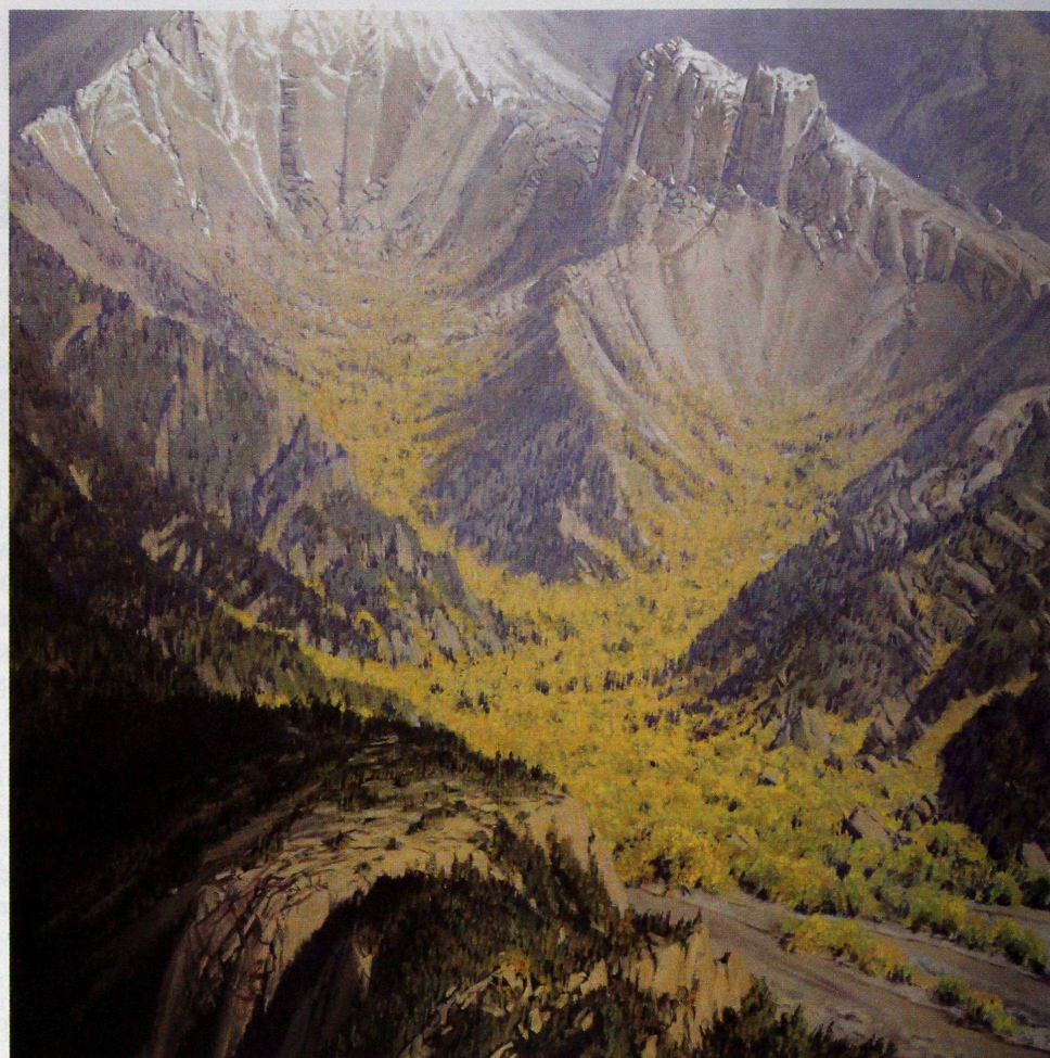
"Glaciers of Gold" 48 x 48 inches, oil on canvas.